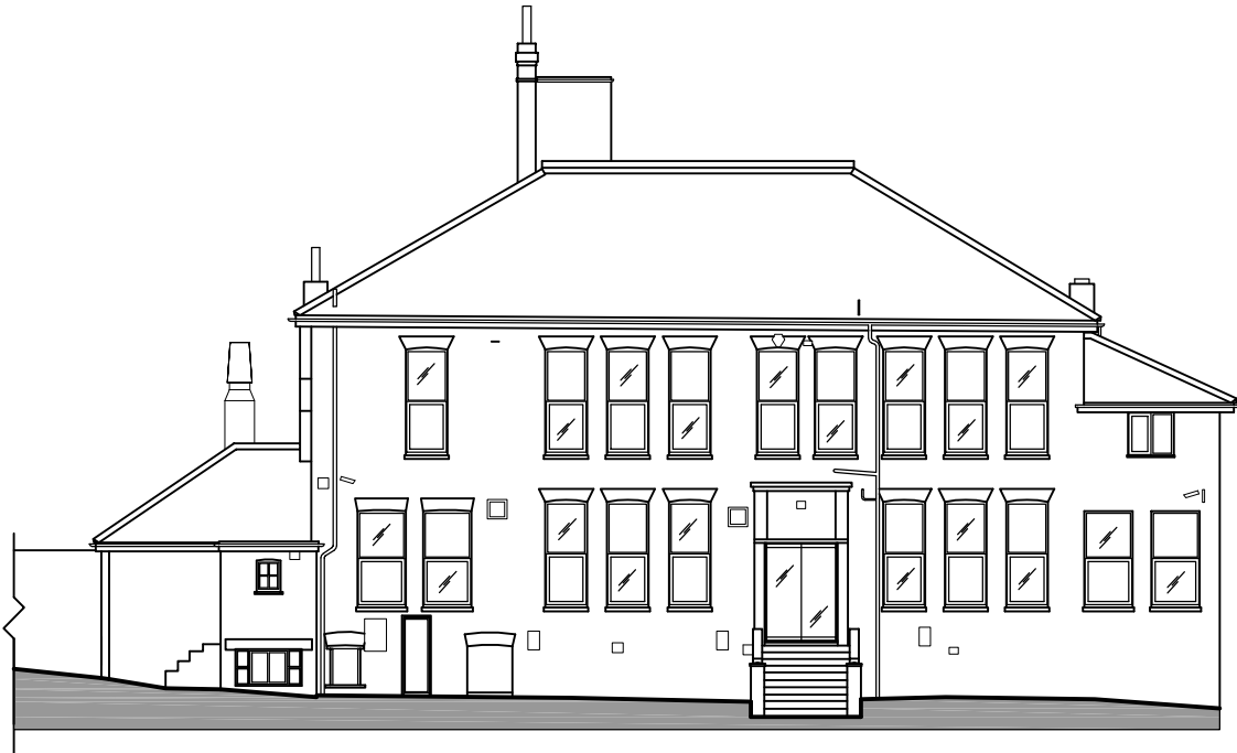
EXISTING REAR CAR PARK ELEVATION